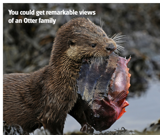
You could get remarkable views of an Otter family

All Shetland Nature trips are meticulously planned, but this exclusive Bird Watching reader holiday has been designed to showcase the full spectrum of Shetland's late-spring wildlife. Our fully bonded holidays are carefully balanced to offer wildlife encounters not possible with larger groups. Limiting our group sizes to six clients per guide permits not only a much more personal rapport between our guides and their group but, most importantly, increases our opportunities, including a day spent exploring the secret lives of an Otter family.