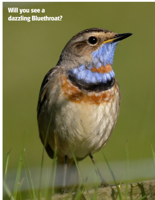
Will you see a dazzling Bluethroat?