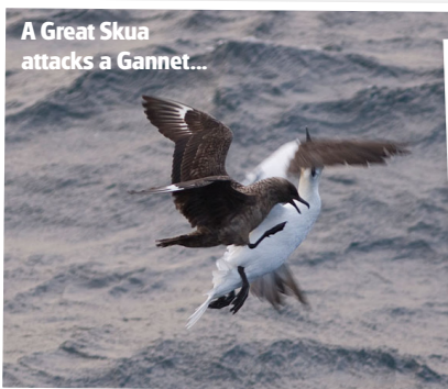
A Great Skua attacks a Gannet...

Shetland has acquired my taste and I will be back to sample more of its superbly distilled essence. ☺