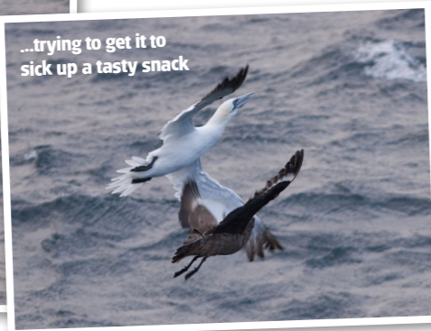
...trying to get it to sick up a tasty snack